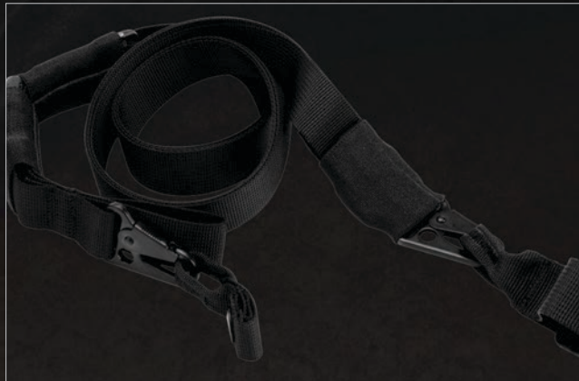
3 POINTS SHOTGUN STRAP