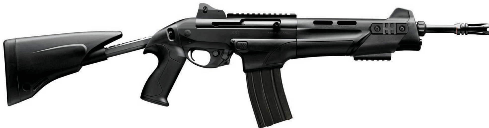
12,5"+2" TELESCOPIC STOCK