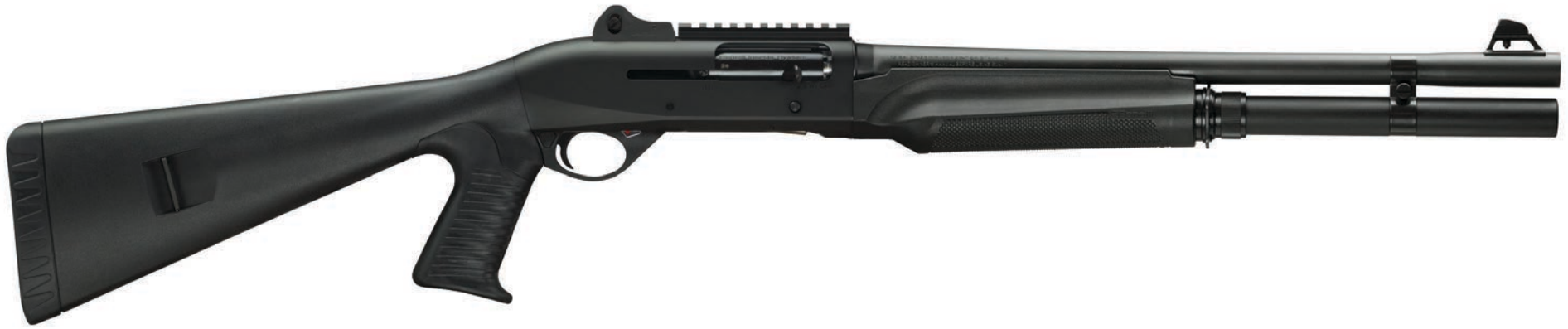
14"+ DOOR-BREACHER PISTOL GRIP STOCK