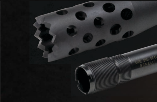
DOOR-BREACHER AND CHOKE