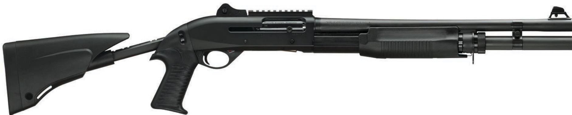
14"+ DOOR-BREACHER TELESCOPIC STOCK